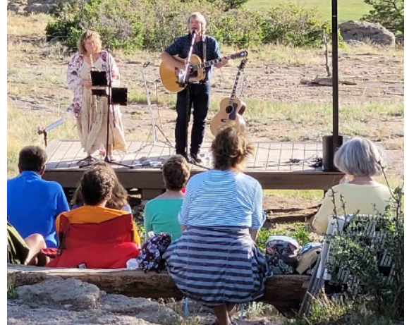
The new stage, financed by Friends, was perfect for the evening concert before 77 people.