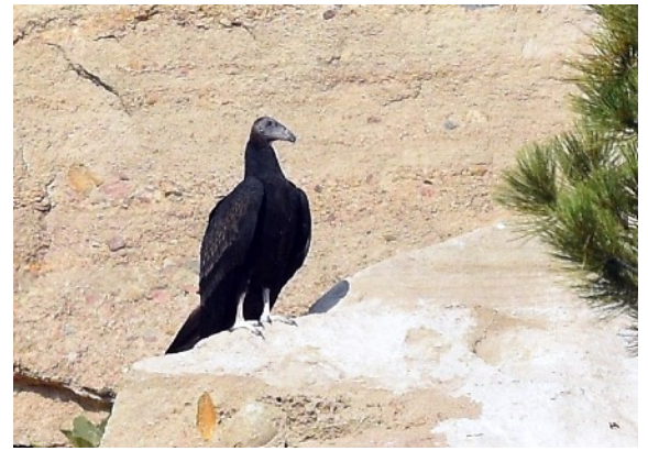
This young turkey vulture was raised in the park last year.

The CAS Raptor Monitoring Volunteers say thank you to Friends!